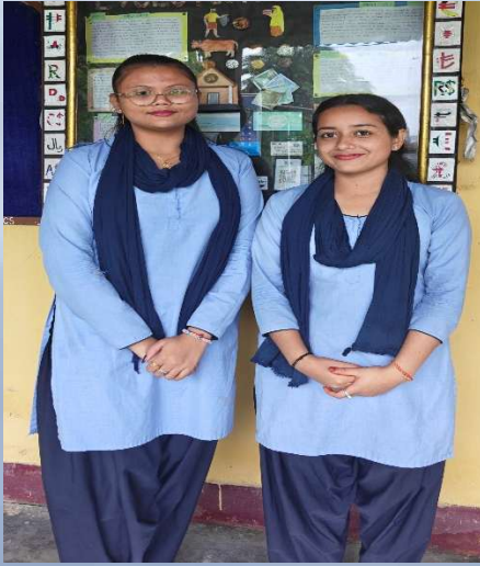
Girls: Light Blue kurta with Navy blue pajama and dupatta.