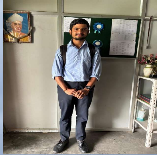
Boys: Light Blue Shirt and Navy Blue Pants