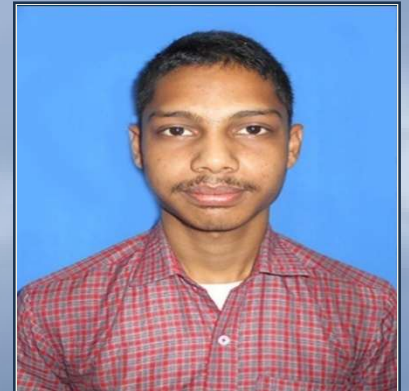
KRISHNA DAS (2023)