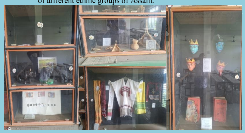
The Department of Assamese also maintains a museum reflecting various traditional and ethnic cultural artifacts.

Museum: Damdama College has one museum at the department of History. The museum has sufficient collections of artifacts, manuscripts (Sachi-puthi), different cultural items of different ethnic groups of Assam.