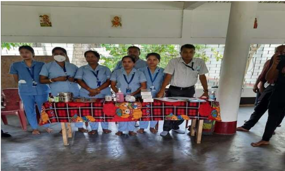
Free Health Camp at Hadala Village Organized By NSS Unit Damdama College on 20/07/2022