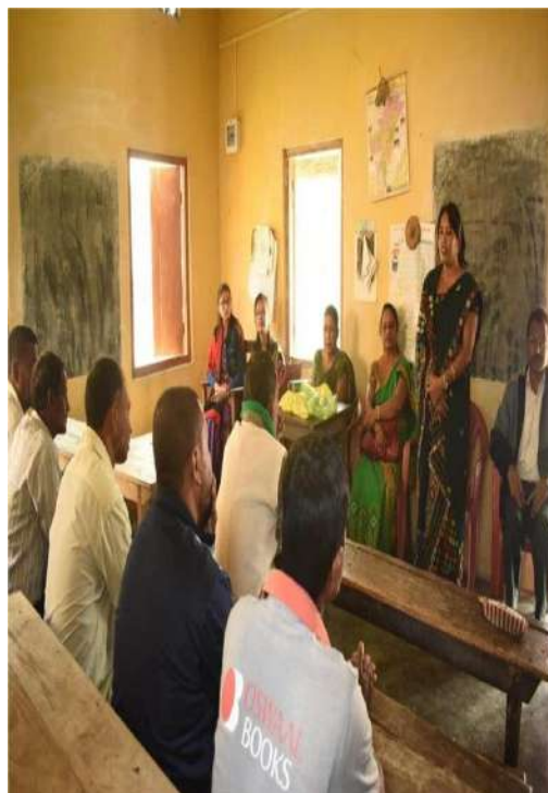
College faculties with the teachers and students of Hadala L.P. School